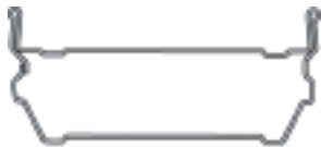
Profile view of Vitroform+

The flexibility of Vitroform+ doesn't stop with its design. Vitroform+ can be used with any insulated glass sealants.